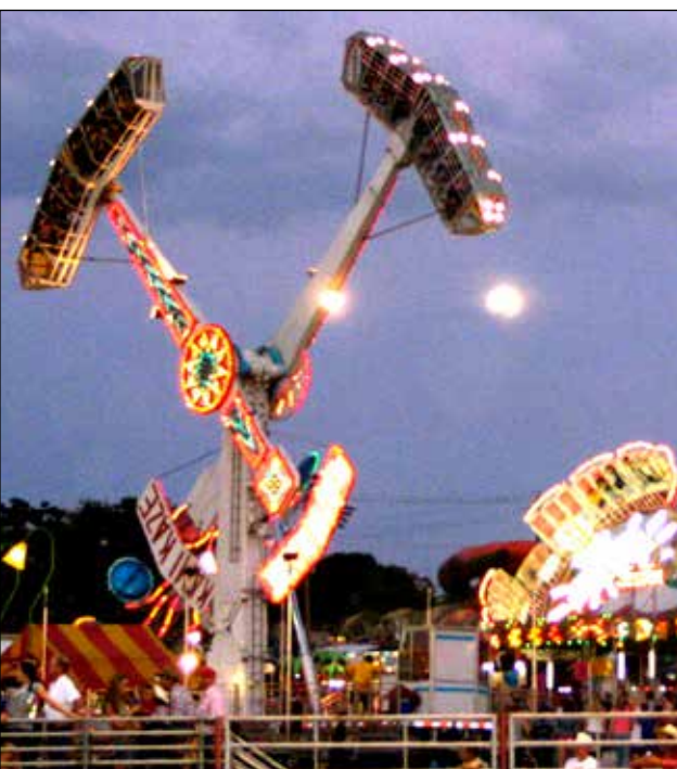
Carnival under a full moon.