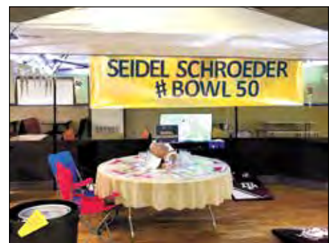
Seidel Schroeder had a 50 Year Anniversary theme at its table.