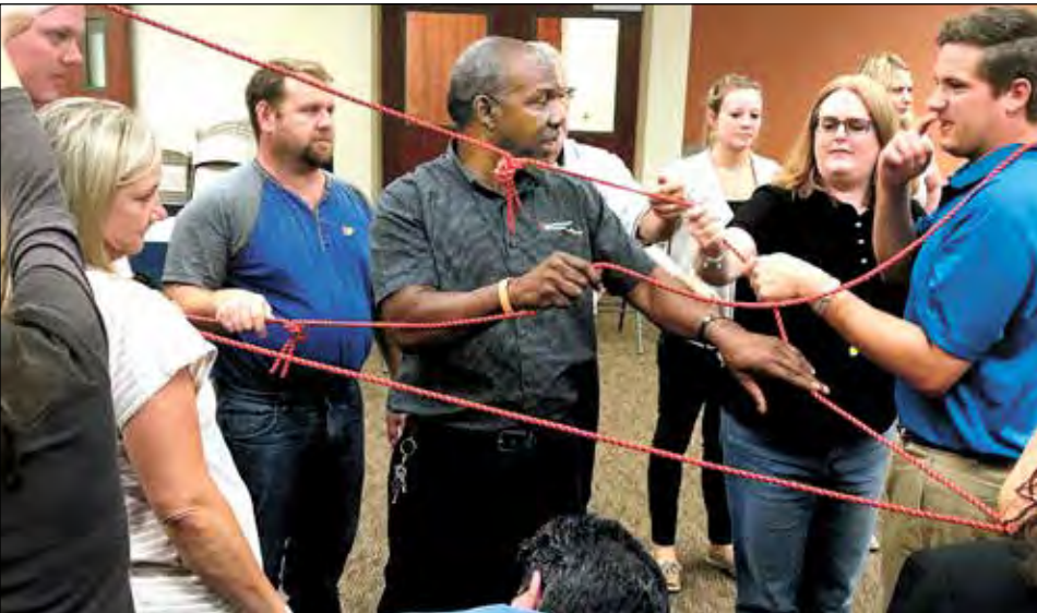
The group works together to untangle a rope and form a circle under challenging conditions.