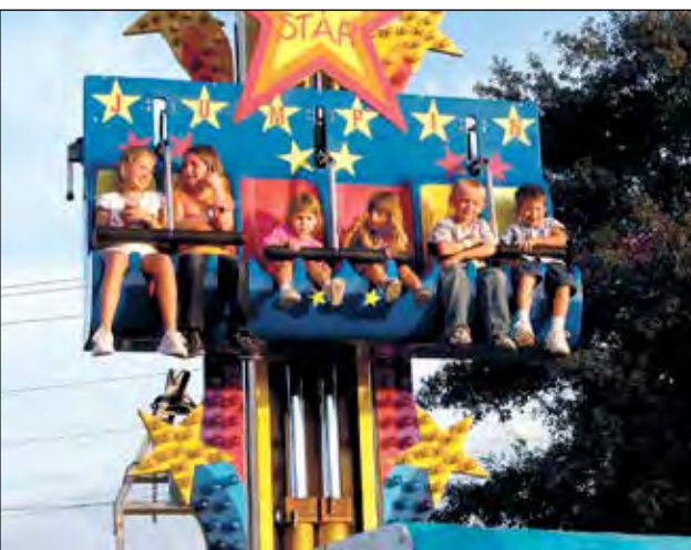
Thrills on a carnival ride.