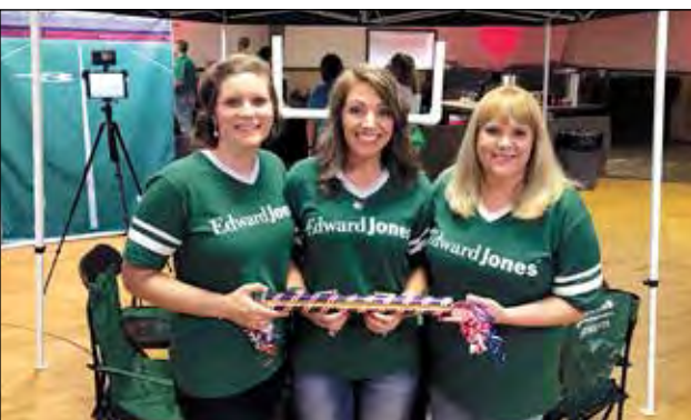
The Edward Jones group took home the Spirit Stick. Their photo booth was a hit!