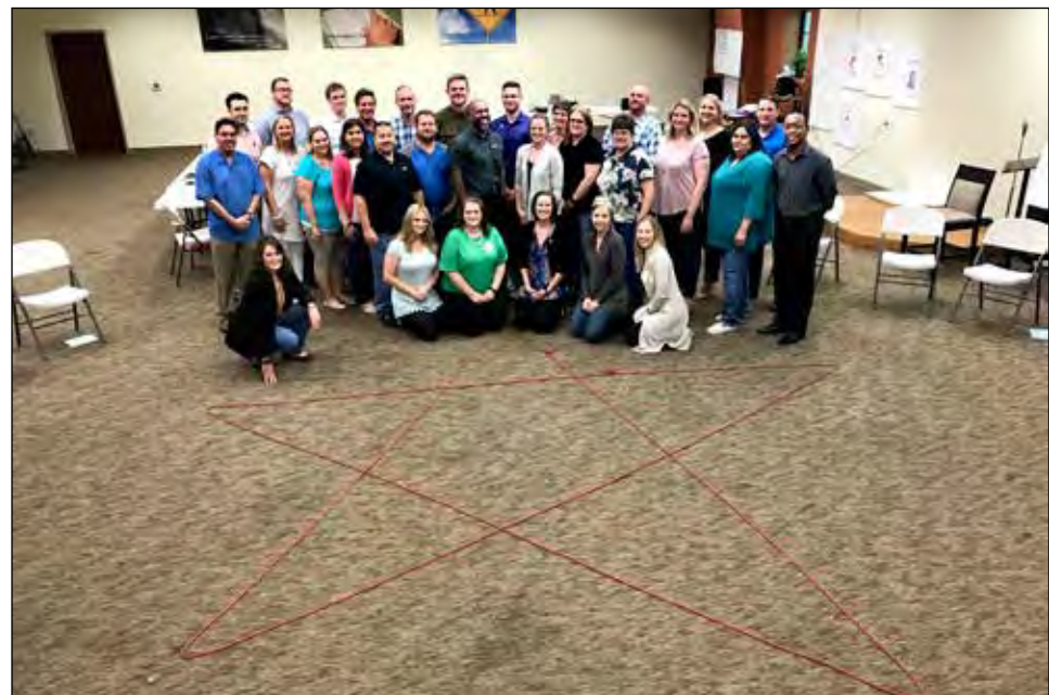
The class worked together to create this star.