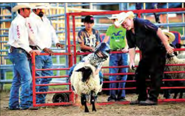
Mutton bustin' at it's finest

It's easy to enter. Pick up entry forms at the Chamber office, at the Visitor Center, or online at www.VisitBrenhamTexas.com . The top three winners receive cash prizes, and winning photos are used to promote Washington County to visitors. So, grab your cameras, everyone!