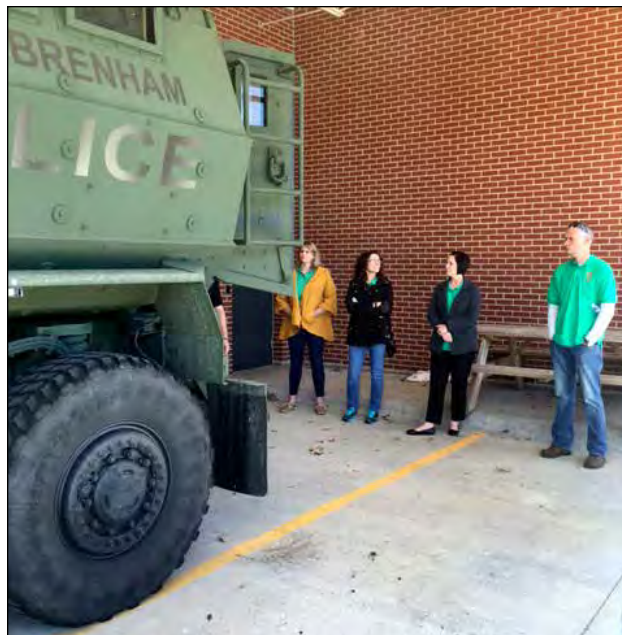
The class gets a look inside one of the SWAT patrol vehicles.