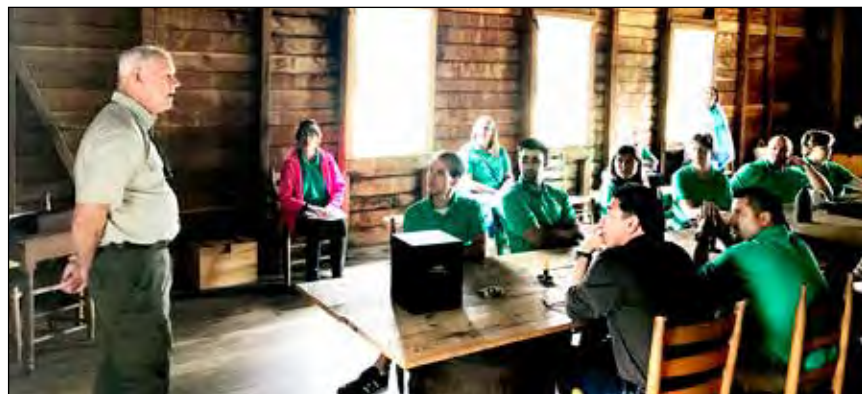
The class hears the history that occurred inside Independence Hall.