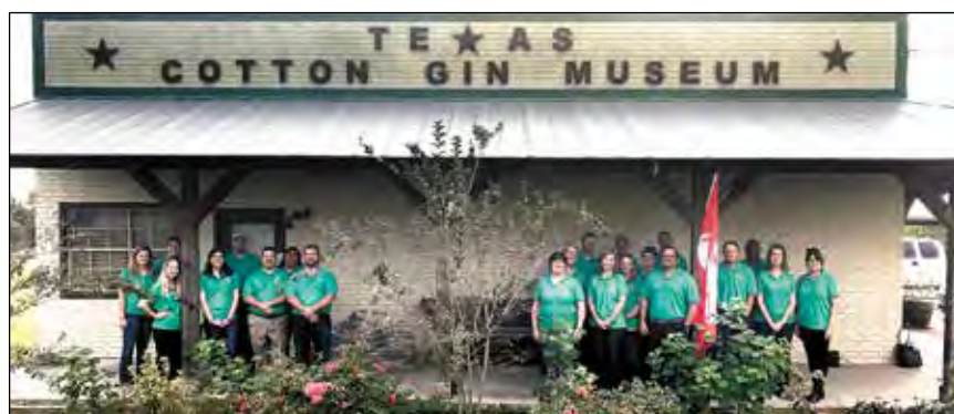
The group ended its session at the Texas Cotton Gin Museum in Burton.