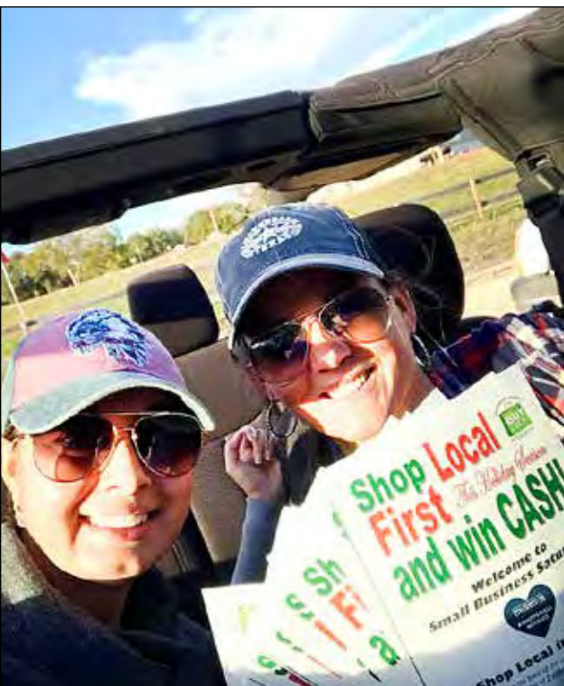
The "Shop Local First This Holiday Season" campaign was a fun way for shoppers to win cash prizes in Chappell Hill, Downtown Brenham and Burton.

11. Without the sales tax dollars that stay in Brenham and Washington County, YOUR property taxes would have to be approximately 14% higher!