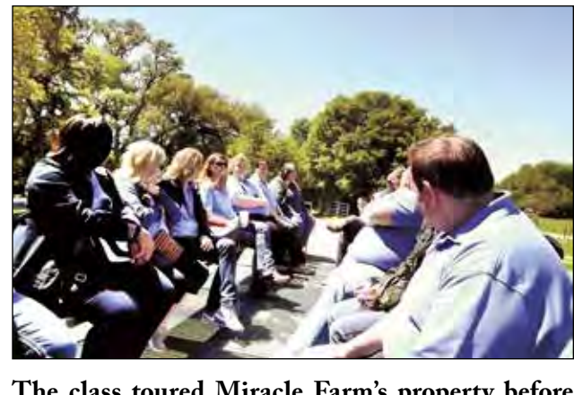
The class toured Miracle Farm's property before watching the residents showcase their horsemanship in the arena.