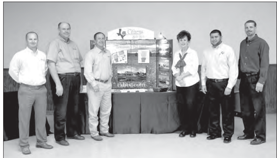
The team from Citizens State Bank, a Headline Sponsor, standing by their exhibit.