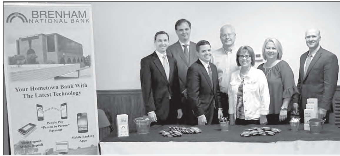
Headline Sponsor Brenham National Bank and their representatives at their exhibit.