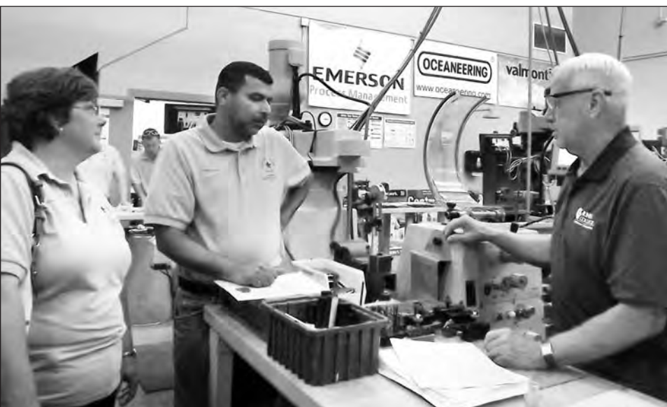
The class got a tour of programs offered at the A.W. Hodde, Jr. Technical Education Center.