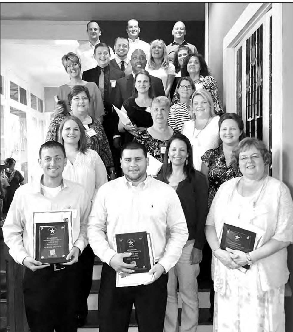
Congratulations to the Leadership Washington County Class of 2016!