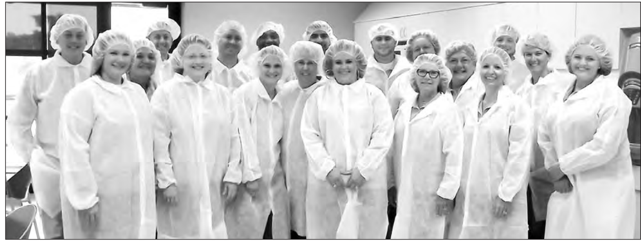
The class enjoyed touring Del Sol Food Co. to see the making of Briannas Salad Dressing.