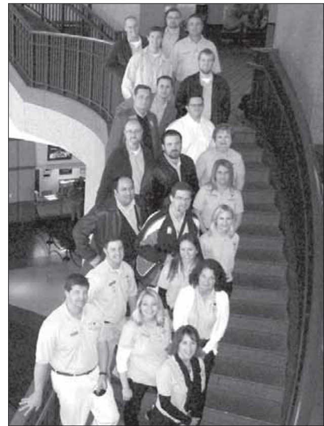
The Bob Bullock Texas State History Museum and the movie "The Story of Texas" brought to life the history of our great state.

Leadership Washington County is a program of the Washington County Chamber of Commerce designed to train and motivate current and future leaders for our community. The next class will form in June & July. For more details and/or an application, please call the Chamber at (979) 836-3695 or visit www.BrenhamTexas.com .