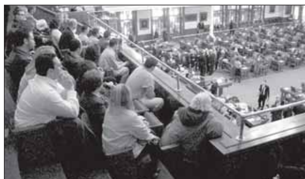
The 2011 Class of Leadership Washington County overlooks the floor of the Texas House of Representatives.