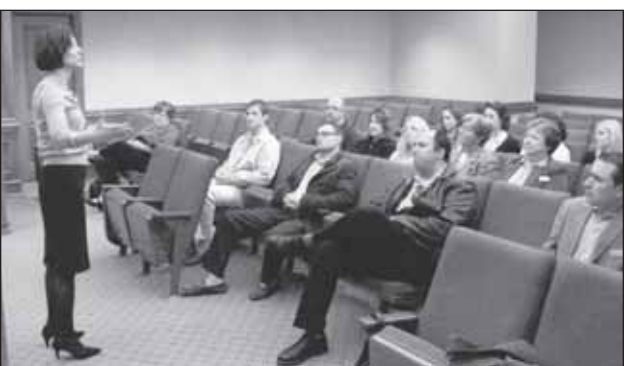
Rep. Kolkhorst gives an overview of issues facing the 82nd Legislature Regular Session.