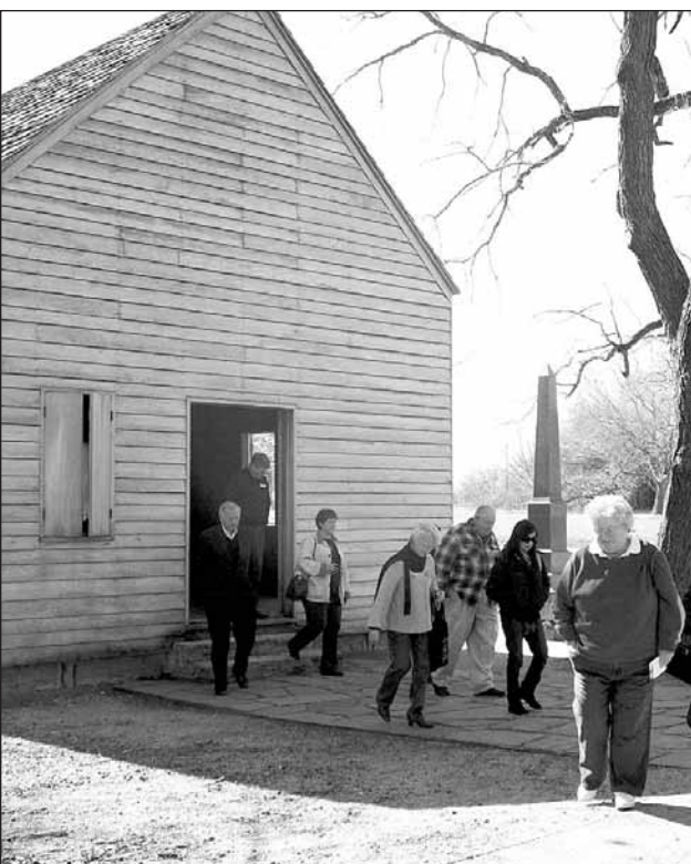
The 11th Annual Texas Independence Trail Region's Texian Rally workshop was held at Washington-on-the-Brazos State Historic Site. Attendees were treated to special tours of Independence Hall, behind-the-scenes tour of Star of the Republic Museum and Barrington Living History Farm.