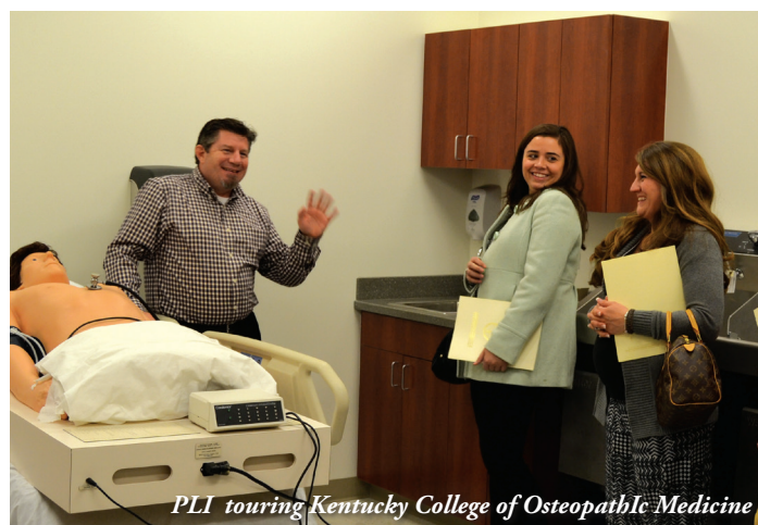
PLI touring Kentucky College of Osteopathic Medicine