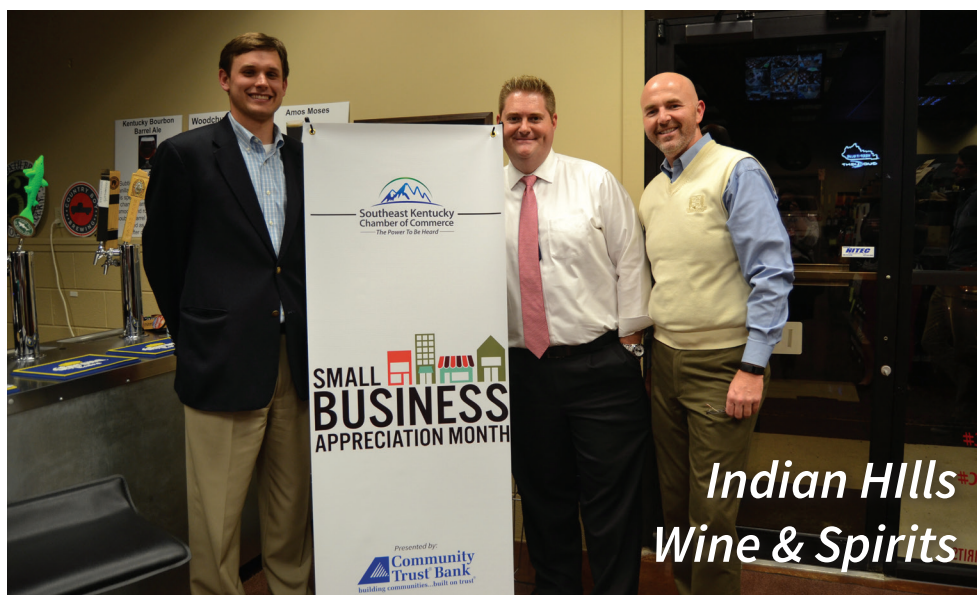
Indian Hills Wine & Spirits

The month was kicked off at Indian Hills Wine & Spirits on Tuesday, November 11. Chamber Members and Indian Hills patrons got to meet the staff, network, and taste a variety of wines and spirits. A representative from Alltech's Lexington Brewing and Distilling Co. as well as one from Southern Wine and Spirits was on hand to provide attendees with additional information regarding the products available for tasting.