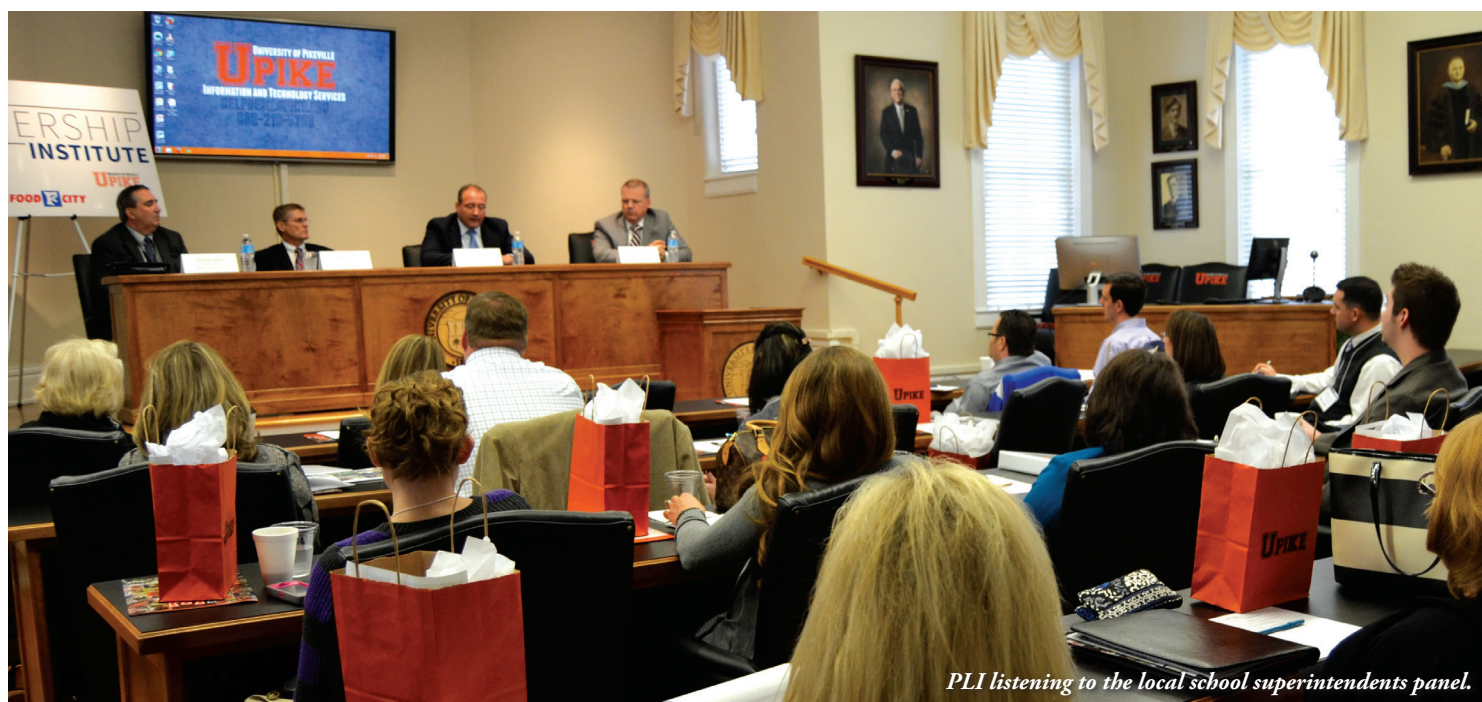
PLI listening to the local school superintendents panel.