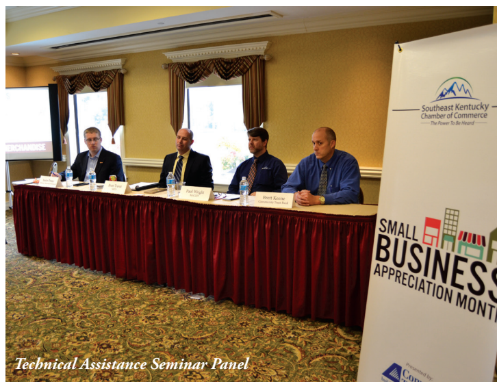
Technical Assistance Seminar Panel