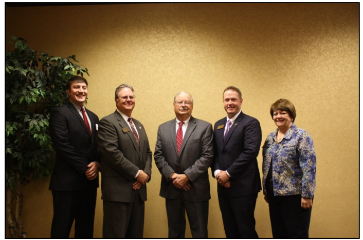
State of the Valley

Please provide a camera ready ad or the Chamber can design your ad for a $50 charge. The acceptable format for a camera ready ad is Adobe PDF or Microsoft Word. All photos need to have minimum 300 dpi and must be CMYK color. If you wish the Chamber to design your ad, please submit the content, logos and any pictures to office@scottsbluffgering.net . A PDF email proof will be provided to you. If you have any questions please contact the Chamber at 308-632-2133 or office@scottsbluffgering.net .