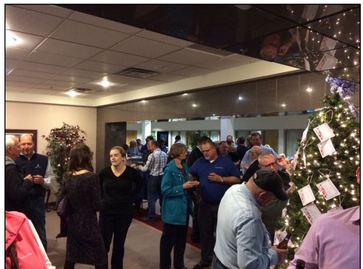
Networking opportunities year-round