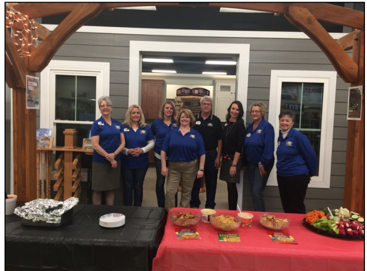
Business After Hours – Team Auto Center