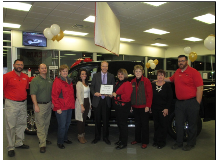
Business After Hours – Team Auto Center