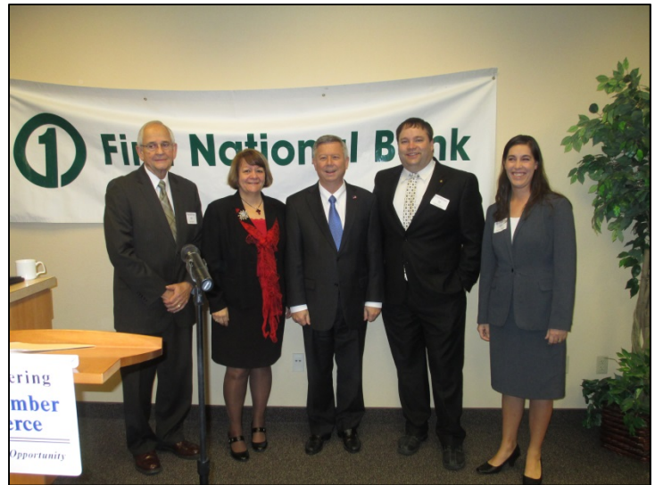
Pre-Legislative Breakfast 2014