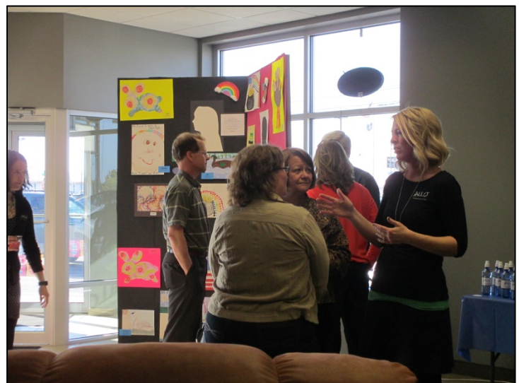
Networking opportunities year-round

Please provide a camera ready ad or the Chamber can design your ad for a $50 charge. The acceptable format for a camera ready ad is Adobe PDF or Microsoft Word. All photos need to have minimum 300 dpi and must be CMYK color. If you wish the Chamber to design your ad, please submit the content, logos and any pictures to chamber@scottsbluffgering.net . A PDF email proof will be provided to you. If you have any questions please contact the Chamber at 308-632-2133 or chamber@scottsbluffgering.net .