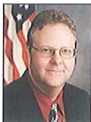
Randy Meininger Mayor of Scottsbluff

Scottsbluff/Gering United Chamber of Commerce 1517 Broadway, Suite 104 • Scottsbluff, NE 69361 308-632-2133 • www.ScottsbluffGering.net