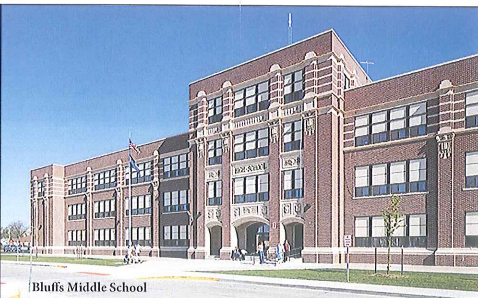
Bluffs Middle School

It is clear that residents can participate in a rich milieu of educational opportunities to enhance their knowledge base, career opportunities and technical skills.