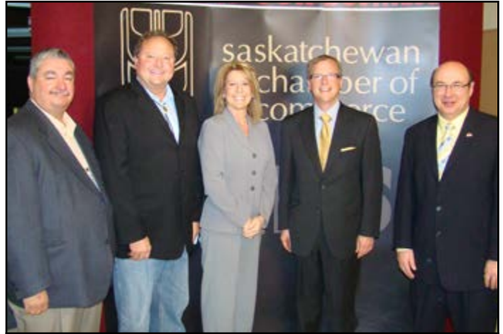
The 2009 Conference on Business

The Rules of Procedure were explained pertaining to the voting process.