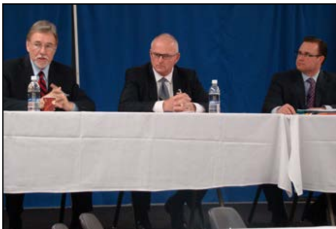
Face-Off with the Ministers at the 2009 Conference on Business