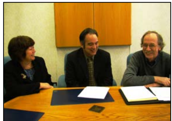
Members of the Growth Strategy Taskforce

Additionally, the GSTF added some new members in 2009 positioning the group for another great year in 2010.