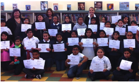
Meeting the San Pedro Elementary School Student Council during the Education session

For more information: Visit srchamber.com or call 415-454-4163, or email emaloney@srchamber.com