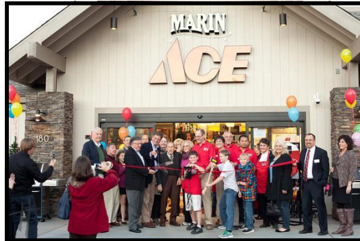
Marin ACE, 2011