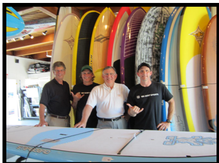
101 Surf Sports, 2012