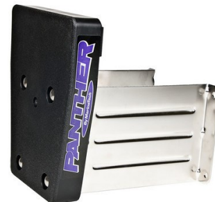
Bracket setback length including Poly board is 10.125"

Always remove your motor from bracket when trailering. Failure to do so may result in damage to boat, motor or bracket.