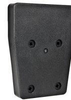
Poly board measures approx. 8" wide x 10" long Part number 99-55650

Always remove your motor from bracket when trailering. Failure to do so may result in damage to boat, motor or bracket.