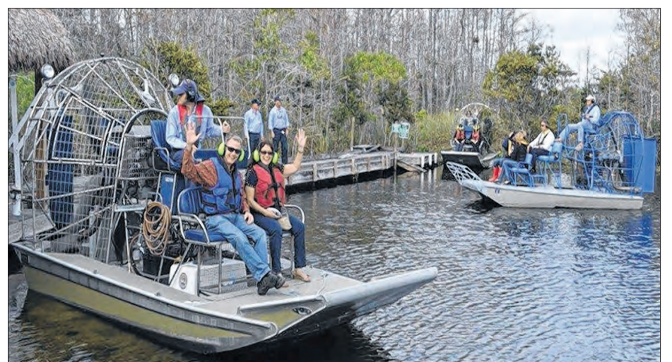
Leadership West Palm Beach Class members enjoy airboat rides at Grassy Waters Preserve.