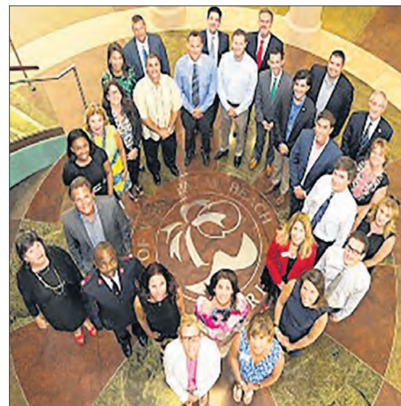
Leadership West Palm Beach Class members graduate at City Hall.