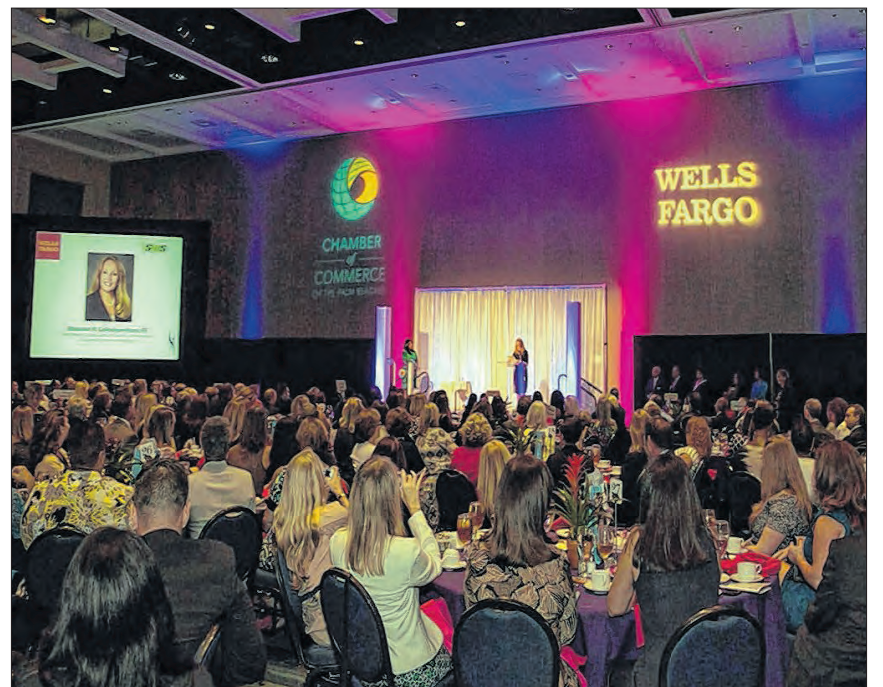
This year marks the 24th anniversary of the ATHENA Awards, which recognizes individuals and businesses that emphasize putting women into leadership roles.