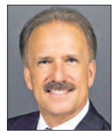
Greg Leach Hospice of Palm Beach County Foundation