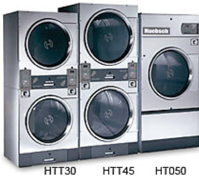
Huebsch single and stack dryers

This is symptomatic of ignition lock-out. Ignition lock-out will occur if the Ignition Control Module (IEI) does not receive confirmation of ignition within 10-14 seconds. Under normal operating conditions, the heat of the burner flame will produce a small current which the IEI will detect via the igniter and ignition cable. Because of their close proximity to the burner, the igniter and cable can lose their connectivity ability. This will prevent the IEI from detecting the flame-induced current, causing a constant ignition lock-out condition.