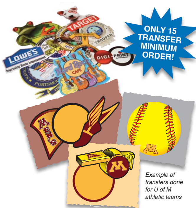
Example of transfers done for U of M athletic teams