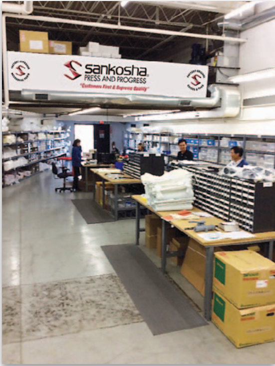
Recently expanded parts warehouse at Sankosha's US office in Elk Grove Village, IL.

In order to serve a growing customer base in North America, Sankosha has invested in its replacement parts business. As part of this project, Sankosha has expanded its inventory of factory original parts to insure a timely delivery for their customers and to support the company's future development.