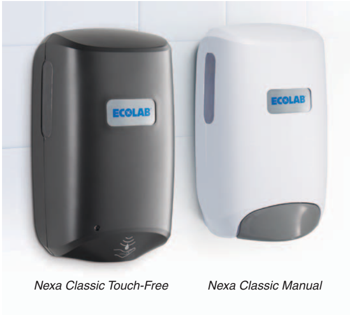
Nexa Classic Touch-Free

Efficiency and sustainability in a new, innovative dispenser.