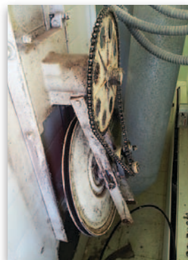
BEFORE: Old Huebsch Chain/Belt drive.