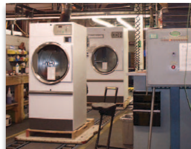
Huebsch dryers on the assembly line in Ripon, WI.