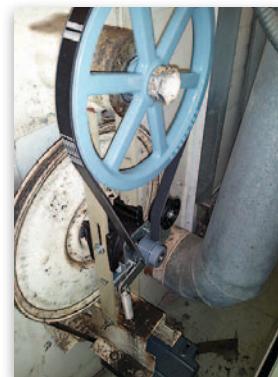
AFTER: New Huebsch All belt drive.