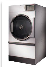
Huebsch 55# dryer fits through a nominal 36" door.