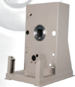
30022 V8Z frame shown

Milnor frames are designed to prevent concentration of stress in one spot and all structural components are tied together for optimum stress dispersion. This proven structural integrity means your machines will last longer.