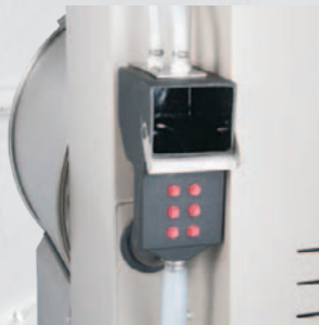
30022 V8Z chemical inlet shown

Chemicals are injected in the rear of the machine (unlike certain brands where chemicals are injected near the front of the machine at eyelevel). Chemicals are diluted and flushed into the sump of the washer-extractor so that raw chemical does not come in direct contact with the linen or the stainless steel.