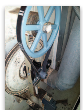
AFTER: New Huebsch All belt drive.