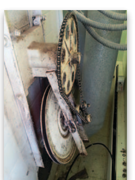
BEFORE: Old Huebsch Chain/Belt drive.