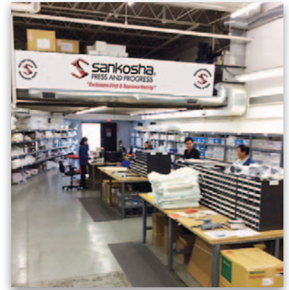
Recently expanded parts warehouse at Sankosha's US office in Elk Grove Village, IL.