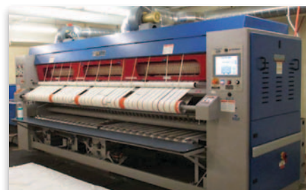
Chicago Tri Star Ironer/ folder