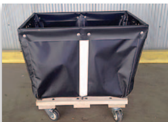
Royal 4 bu. Black Vinyl cart with 4 swivel casters – $100