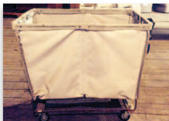
Meese #41 Grey 6 bu. Cart with 4 swivel casters – $99