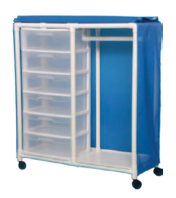
MODEL VL GR 66...... $325 56" H x 50" W X 20" D 6 drawers, 20" hanging bar

When purchasing PVC carts for your facility, go with the very best, IPU. Since introducing PVC health care equipment to the industry in 1985, IPU has gone on to set the standard using only furniture grade PVC along with durable fabric and high performance casters. Beware of low quality imitators. Specify IPU.