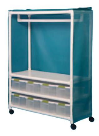
MODEL VL DBC8 ......$380 65" H x 50" W X 20" D 8 bins, 44" hanging bar

Open shelf linen carts also available in this "Value Line".