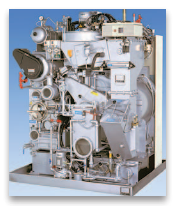
Compact design and fast drying are Columbia features.