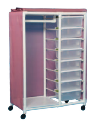
MODEL VL DBC16 .....$460 65" H x 44.5" W X 24" D 16 bins, 22" hanging bar, cover opens on both sides