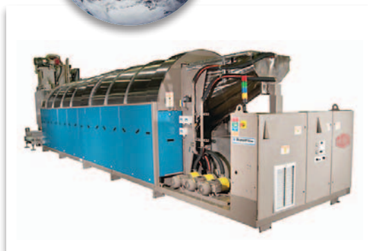
Milnor CBW® batch washing system.

2285 Hampden Ave. St. Paul, MN 55114 651-646-7521 Toll Free: 1-800-328-5689 Fax: 651-649-1101 Service & Parts Fax: 651-646-7206