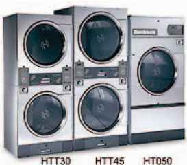
Speed Queen and Huebsch single and stack dryers

This is symptomatic of ignition lock-out. Ignition lock-out will occur if the Ignition Control Module (IEI) does not receive confirmation of ignition within 10-14 seconds. Under normal operating conditions, the heat of the burner flame will produce a small current which the IEI will detect via the igniter and ignition cable. Because of their close proximity to the burner, the igniter and cable can lose their connectivity ability. This will prevent the IEI from detecting the flame-induced current, causing a constant ignition lock-out condition.