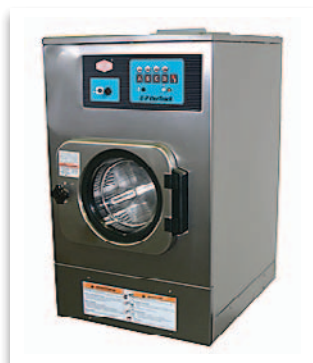
Value price 25# Milnor washer model MWR12E5.