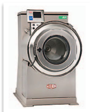
60# Milnor 30022V8Z with MilTouch™ touch screen controller.