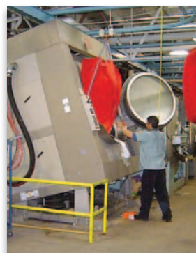
450# two way tilt washer extractors are easily sling loaded.