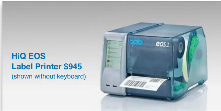
HiQ EOS Label Printer $945 (shown without keyboard)

You Tube See this system in operation at: https://youtu.be/C_iIBkRA1P4