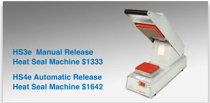
HS3e Manual Release Heat Seal Machine $1333