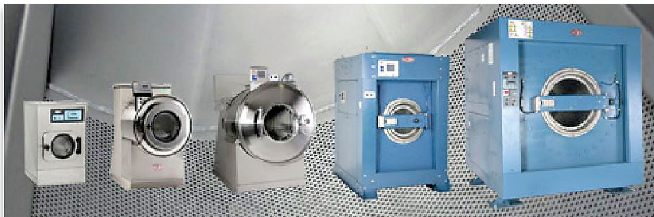
Milnors in sizes from 20# to 650#.

RinSave saves water, sewer and time in your laundry.