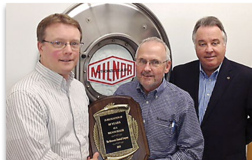
Over 50 years as a Milnor dealer.