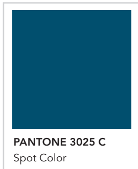
PANTONE 3025 C Spot Color