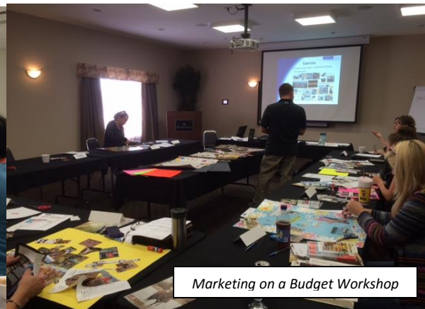
Marketing on a Budget Workshop