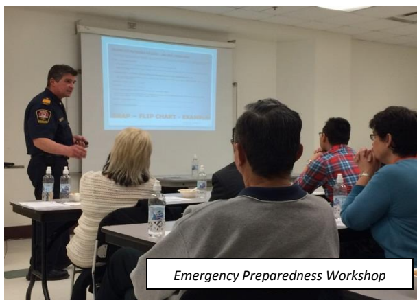
Emergency Preparedness Workshop

The Chamber also promoted and often participated in hosting workshops such as the free information session on working with low oil prices in March. The Chamber also participated in workshops like Stewards in Motion (bringing together community groups, industry and municipal representatives to collaborate and work together on environmental projects in the region) and other workshops in the region, as well as surrounding regions. Although the Chamber could not market and distribute all events, we focussed on ensuring any relevant workshop, tradeshow or event is listed on the Chamber's website , for those members who might find it interesting. At other times the Chamber aimed to bring value to members by using their services for meetings and events, such as catering. We also put relevant members in touch with possible beneficial situations, such as the Water North Coalition that was connected with restaurants and hotels with their workshop in Lac La Biche.