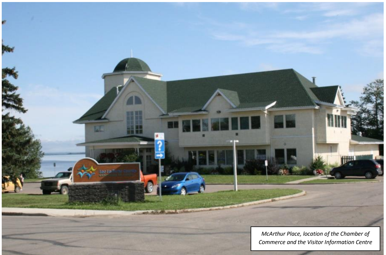
McArthur Place, location of the Chamber of Commerce and the Visitor Information Centre