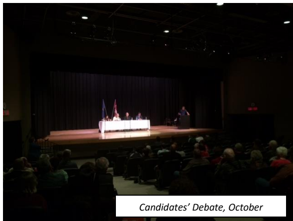
Candidates' Debate, October

The Chamber was part of a group that looked at the possibility of hosting a Woman's Conference in Lac La Biche, which would in time have included a trade show. However, the initiative was not successful. The Chamber was also approached to participate in various committees, such as Interagency, Welcoming Communities and the Safety Awareness Society. Although the manager initially attempted to attend some of these committee meetings, it proved to be too many much of a time constraint, especially with the commitment to having the Visitor Information Centre open 8 hours day. The board will have to determine which committees to join, and which committees to support. The Chamber has joined a Steering Committee that is in the progress of organizing EARN (Employee Assistance and Resource Network) events in Lac La Biche once again.