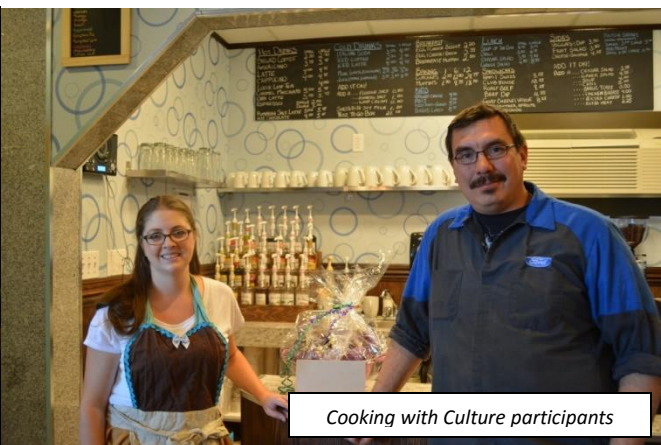
Cooking with Culture participants