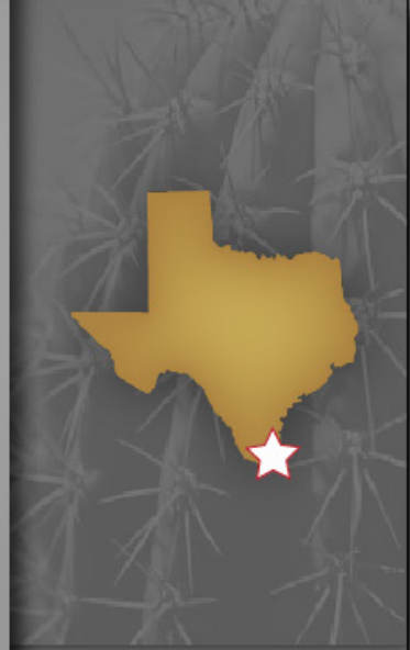
George P. Bush Texas Land Commissioner