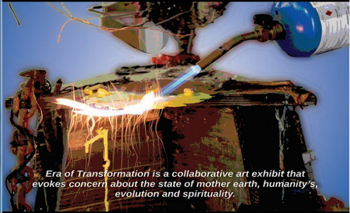
Era of Transformation is a collaborative art exhibit that evokes concern about the state of mother earth, humanity's, evolution and spirituality.

Opening Reception Thursday July 9, 2015 6:30 PM - 9:30 PM Exhibition runs July 9th - August 29th Open to the Public!