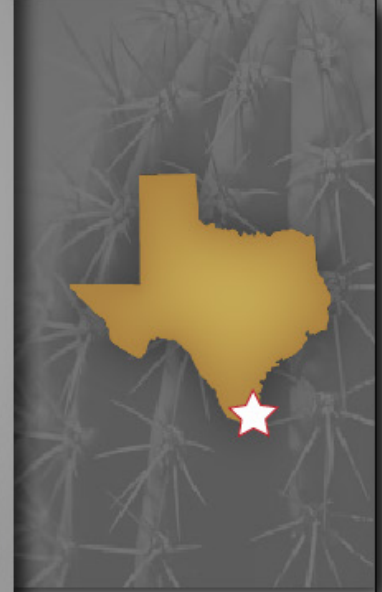
George P. Bush Texas Land Commissioner