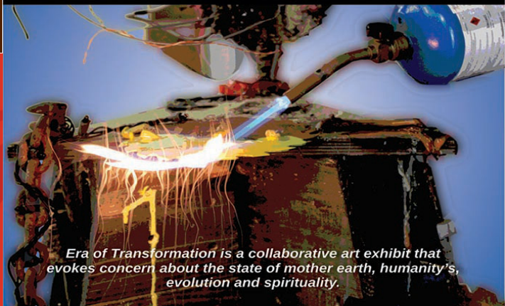
Era of Transformation is a collaborative art exhibit that evokes concern about the state of mother earth, humanity's, evolution and spirituality.

Opening Reception Thursday July 9, 2015 6:30 PM - 9:30 PM Exhibition runs July 9th - August 29th Open to the Public!