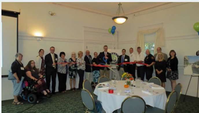
COAST celebrating 35 Years at their recent Annual Meeting at The Governor's Inn