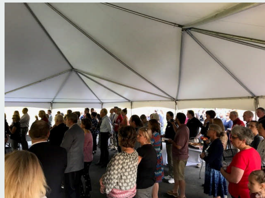
Nearly 200 gathered for the grand opening of the Monarch School of New England's regional high school and vocational center