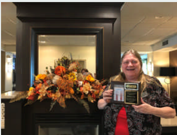
Last month, Hampton Inn (left) and Middleton Building Supply (right) were recognized for their 10 years in the Chamber.

Those celebrating 10 or 25 years of membership are presented with a special Chamber anniversary plaque for their support. Those celebrating 20 years of membership are presented with a special anniversary plate for their continued support.