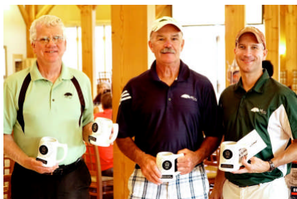
First place team from HRCU