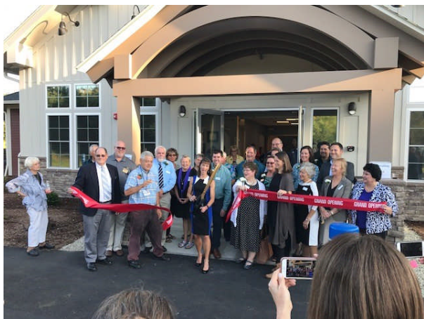
Monarch School celebrating the grand opening of their new regional high school and vocational center