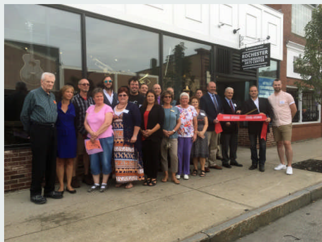
Rochester Opera House celebrating the grand opening of the Rochester Performance & Arts Center