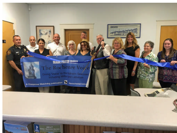
Celebrating The Rochester Voice joining the Chamber.