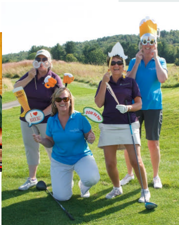
Best Dressed Team