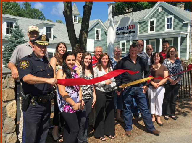
SmartATI Construction recently celebrated relocating to 16 Whitehall Road, Suite 2 in Rochester!