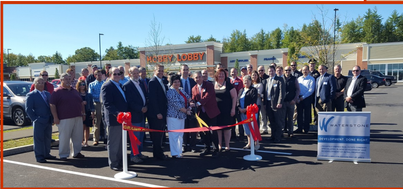
Waterstone Retail celebrated the grand opening of The Ridge Marketplace with a ribbon cutting ceremony!