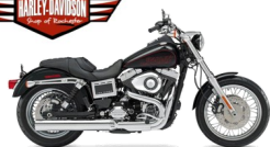
2015 Harley-Davidson DYNA Low Rider FXDL 103 Vivid Black