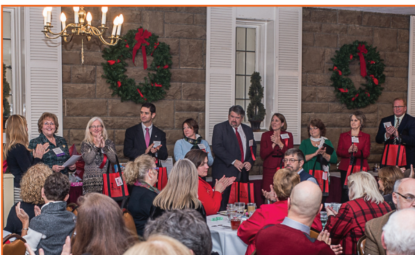
The outgoing 2013 Board of Directors, along with staff of the Granville Area Chamber of Commerce.