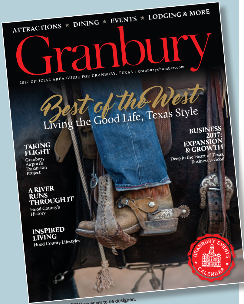
2017 cover shown. 2018 cover yet to be designed.

CONNECT WITH 80,000+ BUSINESSES AND RESIDENTS