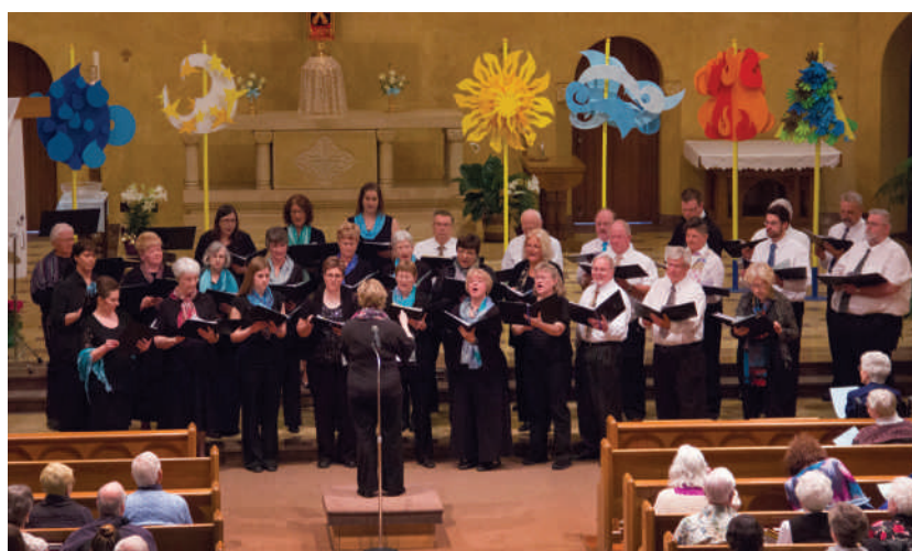
St. Francis Community Chorale raises a joyful noise at last year's spring concert.