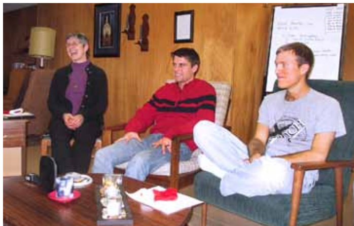
Volunteer Community Room