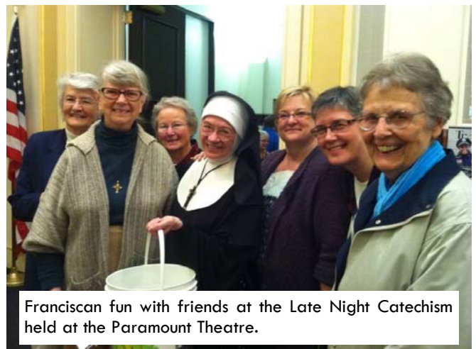
Franciscan fun with friends at the Late Night Catechism held at the Paramount Theatre.

I am blessed to be a part of this ministry. The Franciscan Sisters of Little Falls are amazing. Each day I thank God for the gift of their presence in my life and in the community!