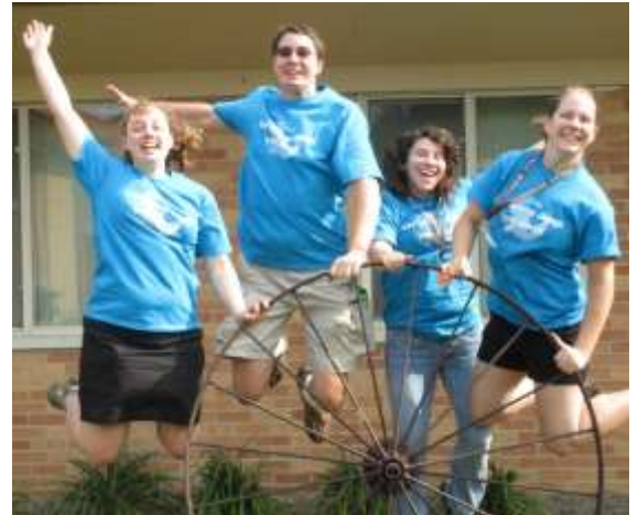
The FCVs "jumping" into this year of Ministry!

From fixing pantry doors, dismantling shelves, painting, cleaning carpets and repairing ceiling tiles to washing the bedding, cleaning top to bottom and filling the pantry. This house was buzzing in preparation and anticipation of a new FCV year!