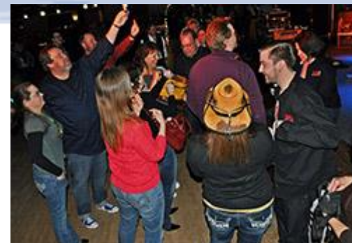
BOB Appreciation Night