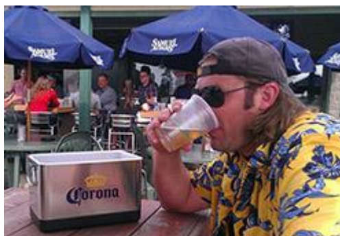
PT on the Patio