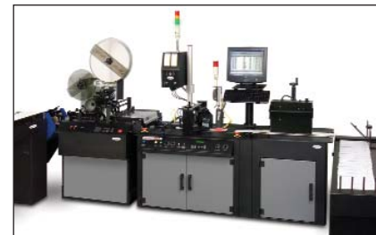
Above, Jet 1 Tabber shown in-line with full Jet 1 system including UltraFeed™ Feeder, Jet 1 Tabber, SIMS (Secap Ink Management System), Postnet Verifier, Printer Base, Dryer, Conveyor.