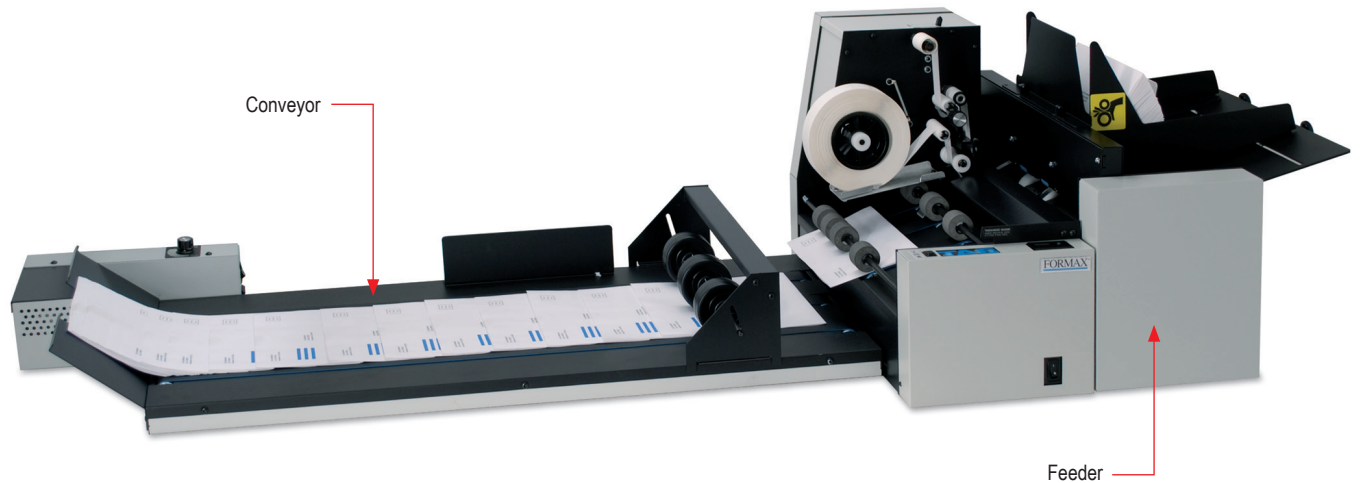
FD 260 Tabber shown with optional FD 260-10 Feeder and optional FD 260-20 Conveyor

The Formax FD 260 Tabbing System makes quick work of applying postal tabs to folded mailpieces. Using “crash tab” technology, the edge of the mailpiece is fed into the FD 260 where it contacts an adhesive tab and travels through a set of rollers where the tab is tightly folded and sealed, creating a mail-ready piece.