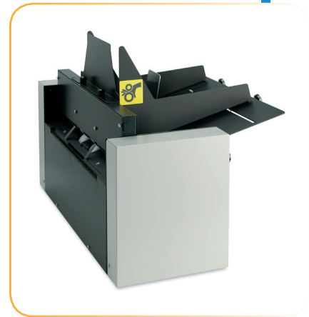
FD 260-10 Feeder