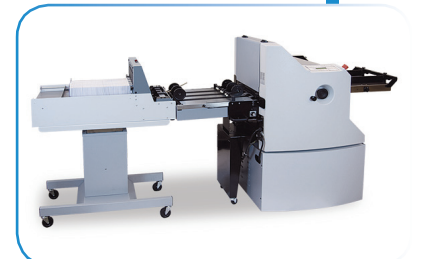
FD 2094 in-line with optional V-Stack36 Vertical Stacker and adjustable stand