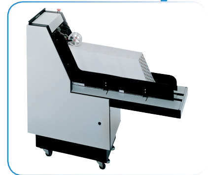
FD 2000-60 Bulk Input Loader (optional for FD 2094)