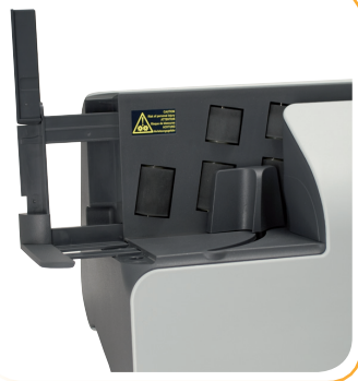
Easy-to-use support arm extends to hold large envelopes