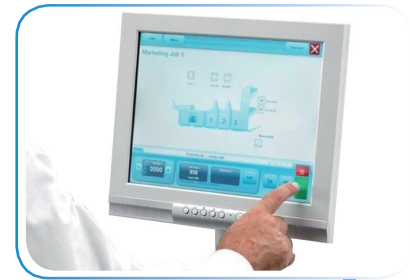
15" Color Touchscreen Interface

* Paper & envelope specifications may vary. All media must be tested.