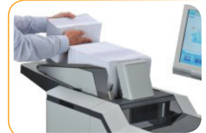
High-Capacity Envelope Feeder