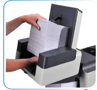
High-Capacity Vertical Output Stacker

** Bottom-address documents can be processed only in Half and Z-fold modes, up to 5 sheets.