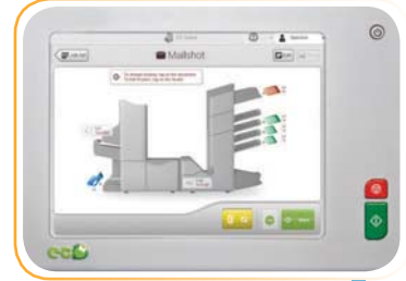
Paper Presence Sensors & Graphical On-Screen Display