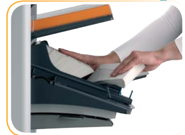
Optional Production Feeder