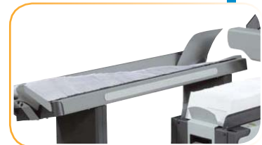
Optional High-Capacity Envelope Hopper and Output Conveyor - Each can hold up to 1,000 envelopes